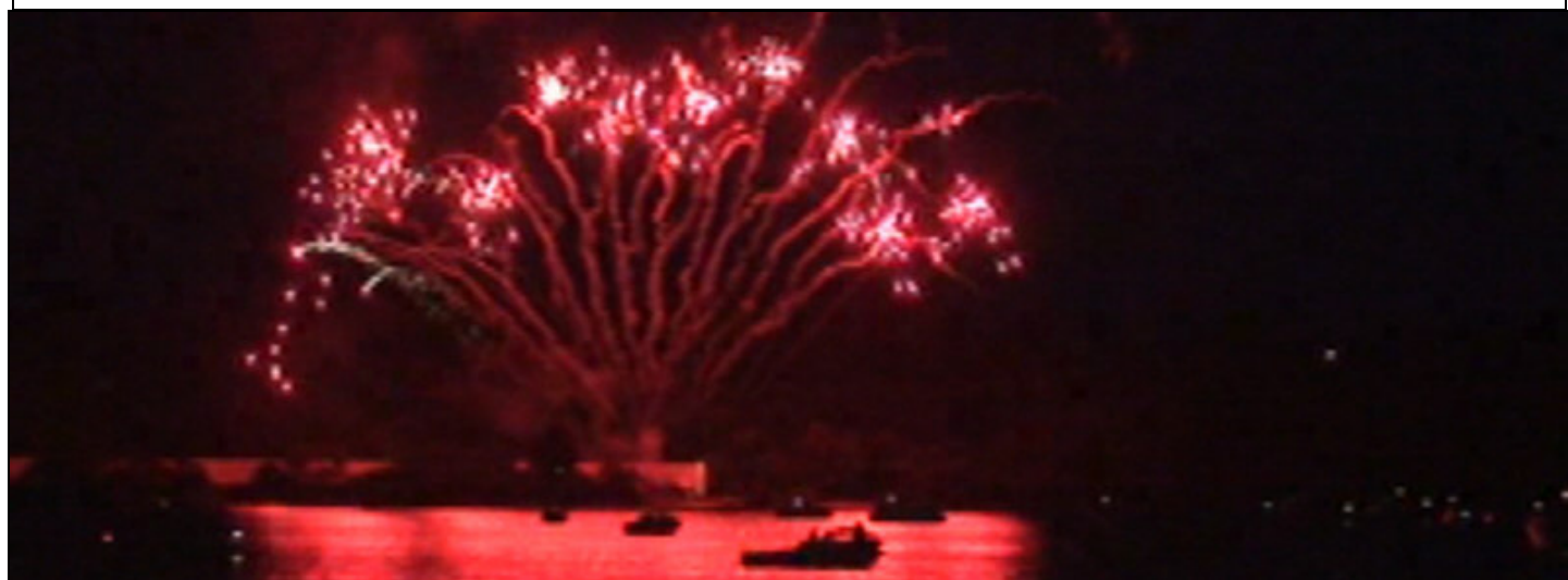
Parry Sound's Canada Day Fireworks—watch for Squadron Sailpast news!